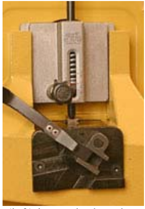
A Carter Quick Release lever (left) is standard on the Powermatic PWBS-14 and makes fully relaxing blade tension quick and easy. The Quick Release lever works independently of the blade tensioning block (right) so the setting is not lost between uses.

For bandsaw blades to perform correctly they must be properly tensioned. The POWERMATIC PWBS-14 Bandsaw system allows precise blade tensioning of the blade according to its characteristics. Handy blade width markings on the tensioning block makes adjusting the POWERMATIC PWBS-14 Bandsaw for blade widths from 1/8"to 3/4" fast and simple. The infinite adjusting system also lets you dial in the correct tension for specialty blades that may require non-standard tension settings.